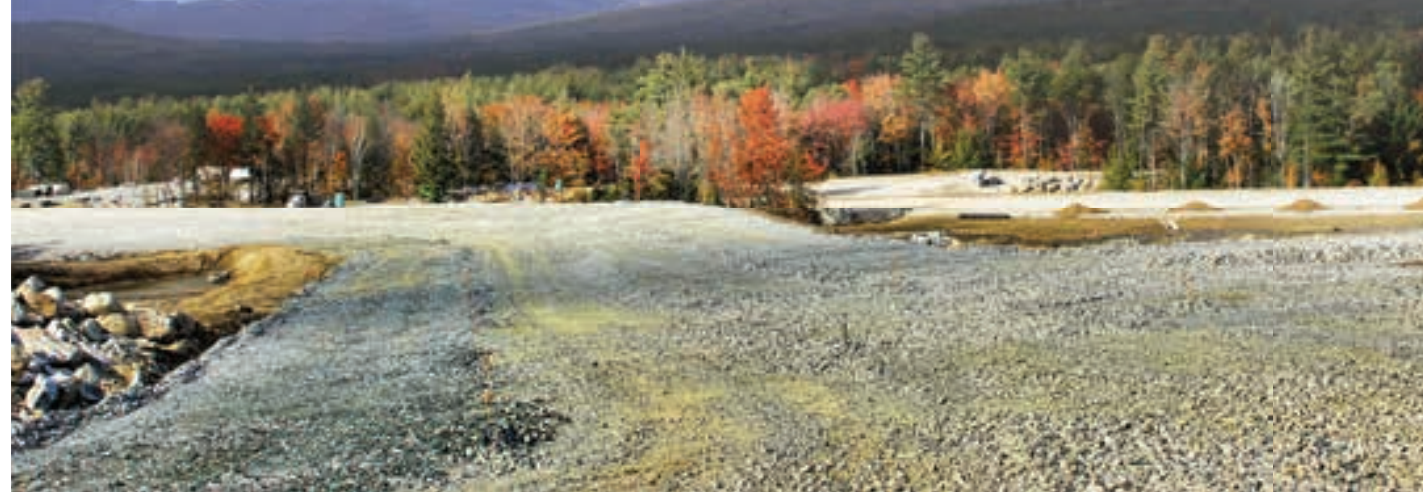
The view coming out of Turn 6 heading into 7. Spectacular.