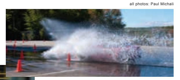
Take your driving skills to the next level... ...and beyond.