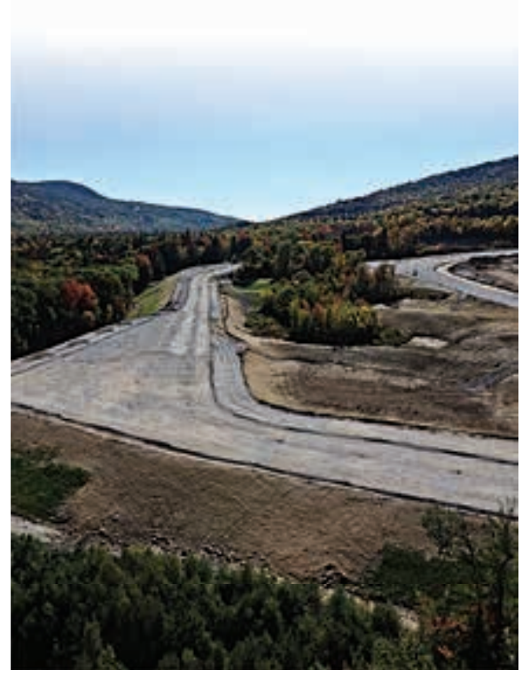
Leaving less and less to the imagination every day.

for very long-term goals, having stamina and sticking with your future, day in and day out... not just for the week, not just for the month but for the years and working really hard to make that future a reality. Grit is living life like it's a marathon not a sprint." In the case of Club Motorsport, I think their grit is fueled by a passion for all things automotive. Not just the joy of motorsport – of being pushed forward by internal combustion that is wrapped in beautifully formed sheet metal – but also the intangibles that emanate from it – like the shared interests that drive friendship and camaraderie. The more I get to know the folks at Club Motorsports, the more I know that these guys have grit coursing through their veins and that they are going to be a huge success.