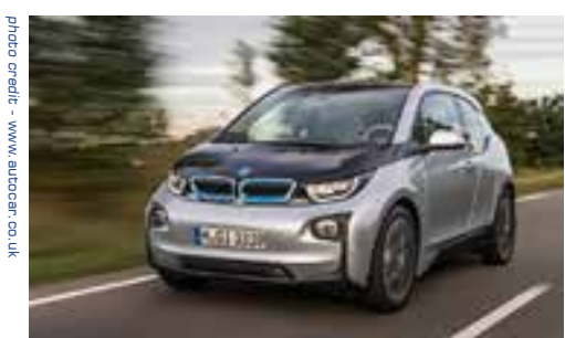
The i3 is BMW's first zero emissions mass-produced vehicle. Sales in the U.S. of this five-door "urban electric car", started in 2014.

The navigation system directed me on the shortest route home. Along the way it was apparent that despite its size, the car had plenty of power to overtake traffic, not just keep up with it.