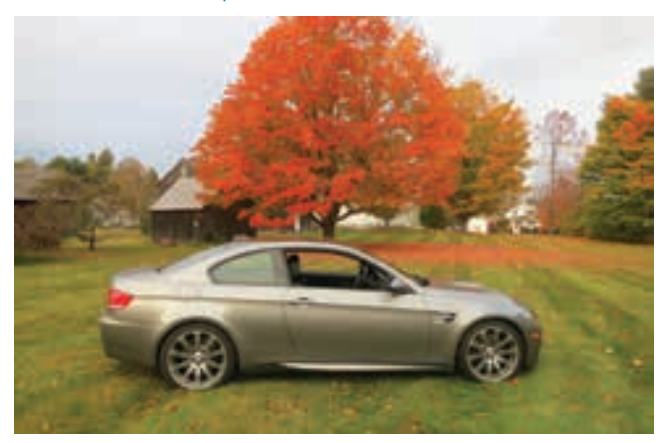
"I took this photo on 10/21/15 in the New London Historical Society Village using a Canon Powershot S100."