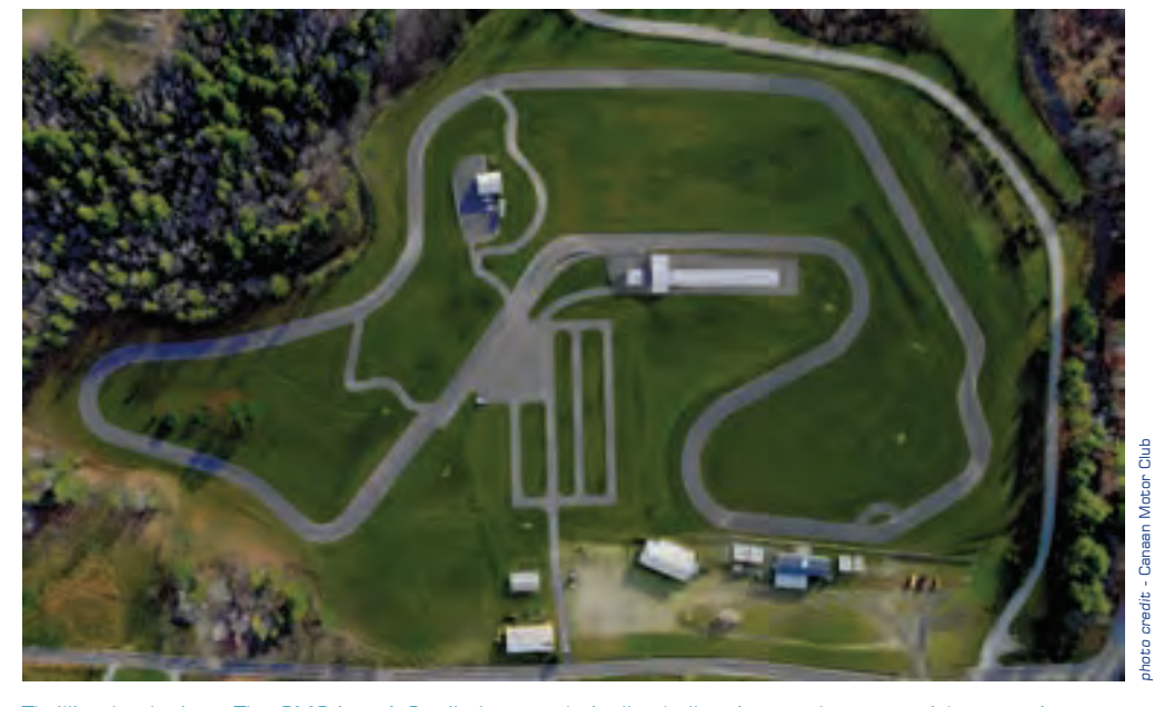
Thrilling by design: The CMC is a 1.3 mile long technically challenging road course with extensive run off areas to promote a safe environment for all track users. The track was designed to run in both directions to give a total of 2.6 miles with nine major turns.