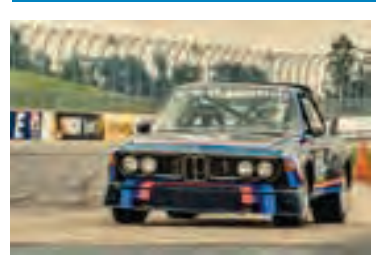
You're only as old as you feel.

post process + design by Martin Callahan