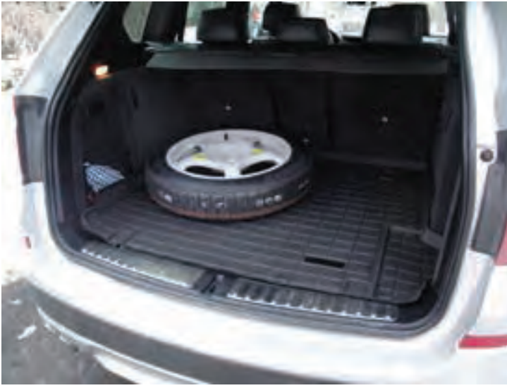
For relatively little money: your basic scissor jack and a mini-donut.