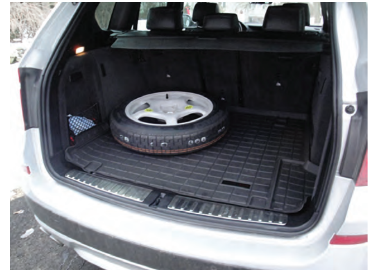
For relatively little money: your basic scissor jack and a mini-donut.