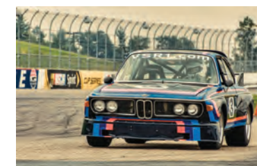
You're only as old as you feel.

original photo by Paul Michali post process + design by Martin Callahan