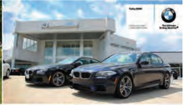
TULLEY BMW OF NASHUA 147 Daniel Webster Hwy. Route 3 to Exit 2.