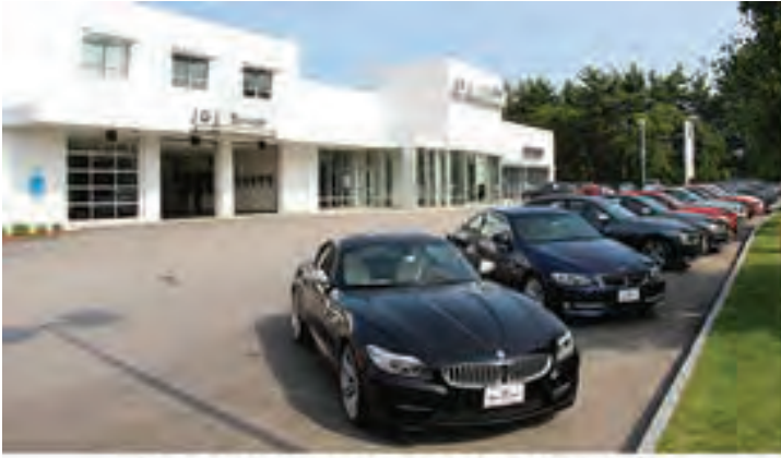
TULLEY BMW OF MANCHESTER 170 Auto Center Rd. Behind Barnes and Noble.