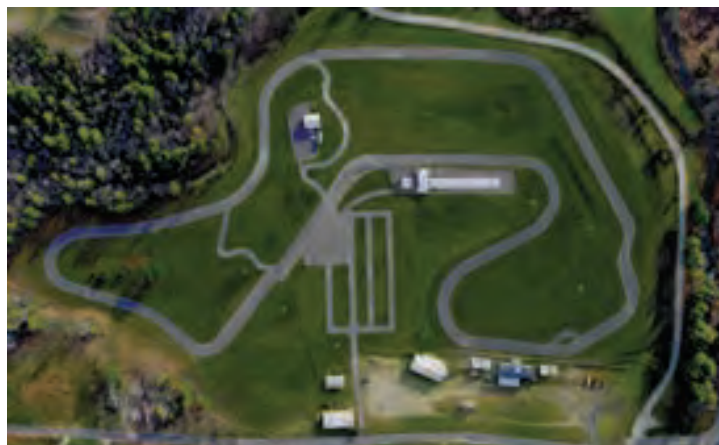
Thrilling by design: The CMC is a 1.3 mile long technically challenging road course with extensive run off areas to promote a safe environment for all track users. The track was designed to run in both directions to give a total of 2.6 miles with nine major turns.