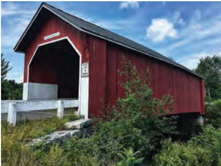
Sometimes it's not so much what you seek, rather what you find, that makes your day.

Then, suddenly... the sparse traffic slowed to a crawl. We saw lawn chairs and flags by the roadsides. Could it be? It is after July 4th... Then more lawn chairs, this time with people in them, families, kids, dogs, cats. I waved to a nice old lady in a lawn chair as we now crept forward. Traffic stopped. One minute passed, then five, then ten. Ahead we could see a fire truck with its lights on. Then silence, I rolled the window down, took in the mountain air, and thought, "What's that?" A sound of distant music... It was getting closer, I heard horses, then saw horses, then saw more horses, then horses tied to a wagon with a band playing tunes. Surprisingly, we discovered we had front row seats at a town's parade! – a full parade,